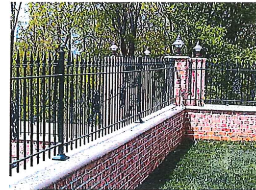
Masonry piers with low wall & Iron or Wood above Location: All areas except front yard

Solid masonry walls may be considered. Location: Side and rear yards up to 6' in height, but limited to 36" courtyard wall in the front and street side yards.