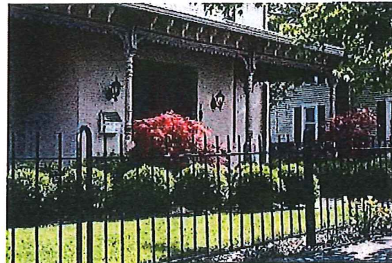
Iron fence Location: All areas. If used in front yard must be less than 42"