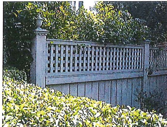
2/3 Solid Wood with 1/3 Open Above 6' maximum height Location: Side and rear yards