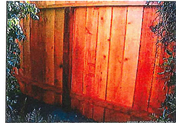
Wood with Batten (post and caps required) 6' maximum height Location: Side and Rear yards